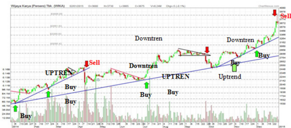
Figure 4 The Chart of classical technical analysis of WIKA from January 1 – 31, 2014

Fourth, on May 27, the buy signal was occurred on accumulation period, which stated that the price rebounded on the uptrend line and MA25. The classical indicator also indicated the form of flag pattern. The modern indicator was seen on the golden-cross with MA7. Bullish stochastic indicator was limited in the area close to overbought area. In the third green histogram, WIKA has moved to positive area with stronger MACD. The buy decision of WIKA was at Rp1.690,00 per share.