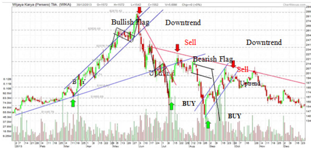
Figure 1 The Classical Technical Analysis of WIKA from January 1 – 31, 2013

Second, on June 5 there were sell signal on WIKA at Rp2.450,00. It was occurred due to a sell signal from both the classical technical analysis pattern that WIKA has reached the upper line of the uptrend pattern and the resistance line two (R2), which indicate the share price has already expensive or overvalued and then investment decisions was occurred through the sale of WIKA at that price.