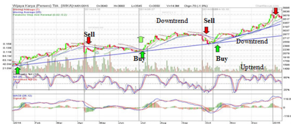
Figure 6 The WIKA Chart of Combination Classical and Modern Technical Analysis from January 1 – 31, 2014

The combination of classic and modern technical analysis on WIKA January 2014 until December 2014 has resulted seven investment decisions. There were four buy signals and three sell signals (See on Figure 6). The whole investment decisions were determined by the combination of classical and modern indicators of technical analysis as a measurement variable.