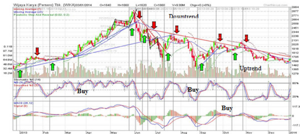
Figure 3 The Chart of Combination Classical and Modern Technical Analysis on WIKA from January 1, 2013 – December 31, 2013

Thirdly, on February 13, the buy signal was formed. Classic technical indicators showed that the price rebounded on the uptrend line. Buy signal was also confirmed from modern technical indicators that was shown from the golden-cross with MA7 and MA25. The stochastic indicators were bullish after the golden-cross was within the oversold area. In third green histogram, it was moved towards the positive area with stronger MACD. The decision to buy shares on WIKA was at Rp1.650,00 per share.